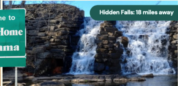
Hidden Falls: 18 miles away