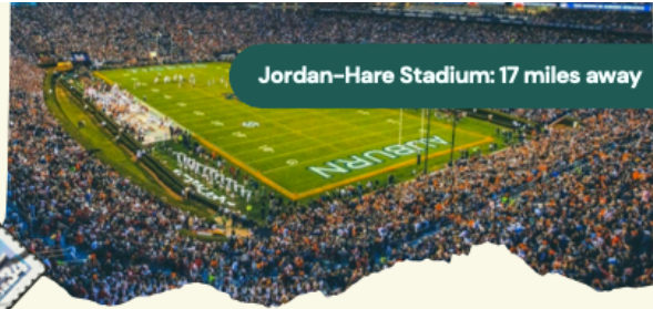
Jordan-Hare Stadium: 17 miles away

There are many attractions that await you here. Enjoy outdoor activities at Chewacla State Park: This park is located just outside Opelika and features hiking trails, a lake for swimming and fishing, camping sites, and picnic areas. It's a great place to spend a day in nature. Go hiking or biking on the Auburn-Opelika Trail: This trail is a 16-mile paved path that connects Opelika and Auburn. It's perfect for walking, running, biking, and rollerblading. The trail also connects to Chewacla State Park and other scenic areas.