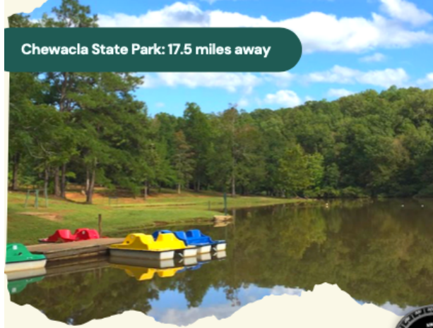
Chewacla State Park: 17.5 miles away

There are many attractions that await you here. Enjoy outdoor activities at Chewacla State Park: This park is located just outside Opelika and features hiking trails, a lake for swimming and fishing, camping sites, and picnic areas. It's a great place to spend a day in nature. Go hiking or biking on the Auburn-Opelika Trail: This trail is a 16-mile paved path that connects Opelika and Auburn. It's perfect for walking, running, biking, and rollerblading. The trail also connects to Chewacla State Park and other scenic areas.