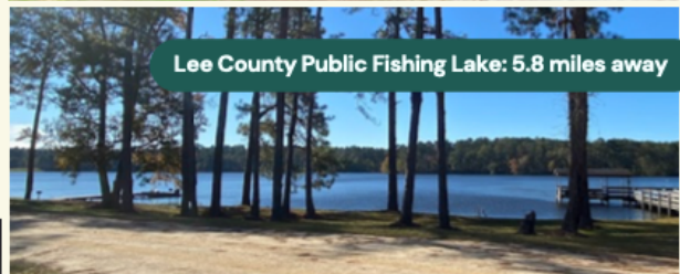
Lee County Public Fishing Lake: 5.8 miles away