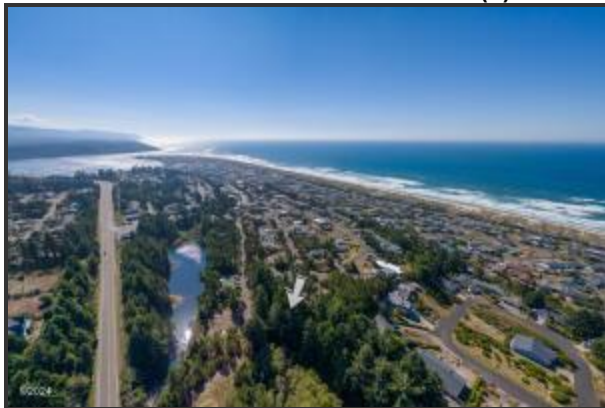
2506 NW MOKMAK LAKE DR (4)