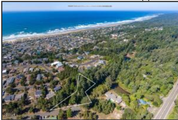
2506 NW MOKMAK LAKE DR (2)