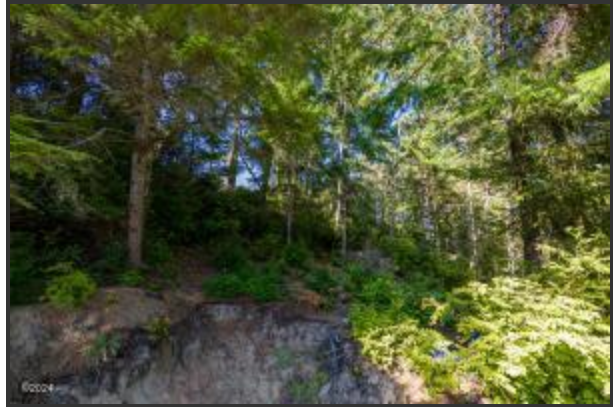
2506 NW MOKMAK LAKE DR (10)