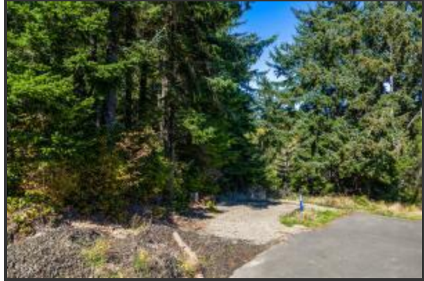
2506 NW MOKMAK LAKE DR (8)