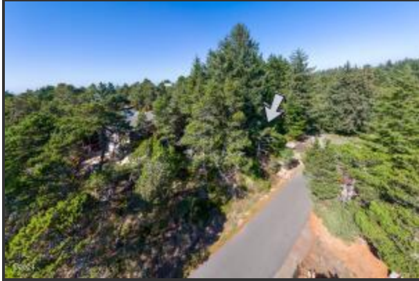
2506 NW MOKMAK LAKE DR (7)