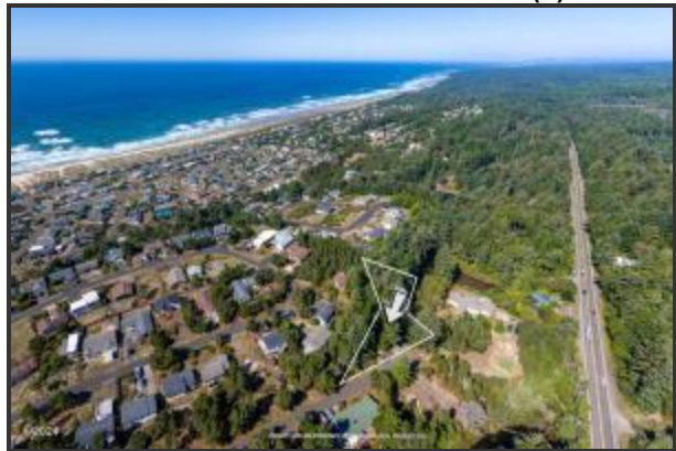
2506 NW MOKMAK LAKE DR (3)