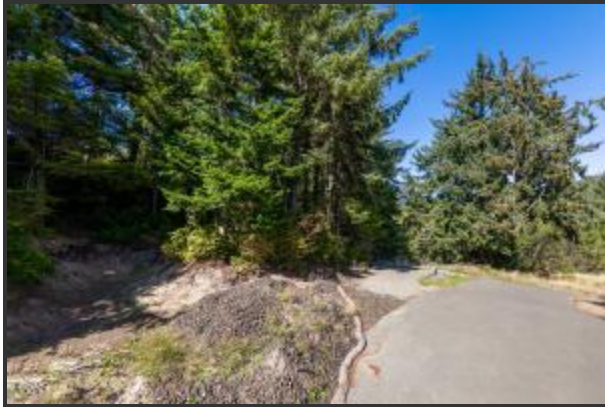
2506 NW MOKMAK LAKE DR (9)