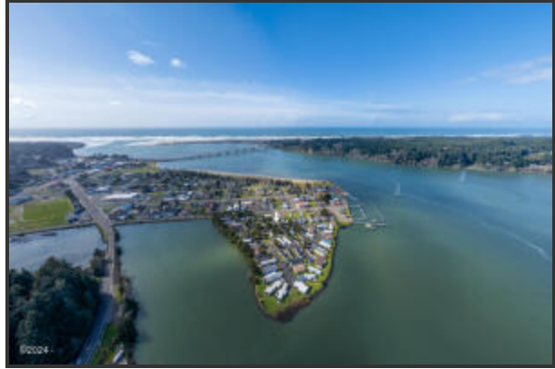
955 NE MILL ST. C-9 (9)