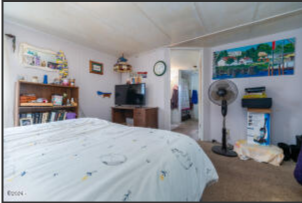
955 NE MILL ST. C-9 (20)