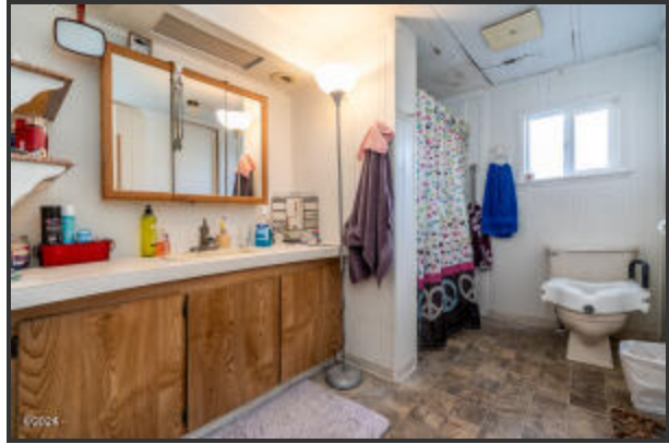
955 NE MILL ST. C-9 (21)