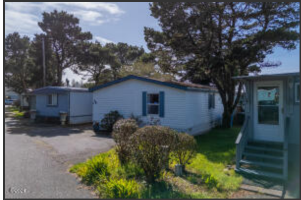
955 NE MILL ST. C-9 (1)