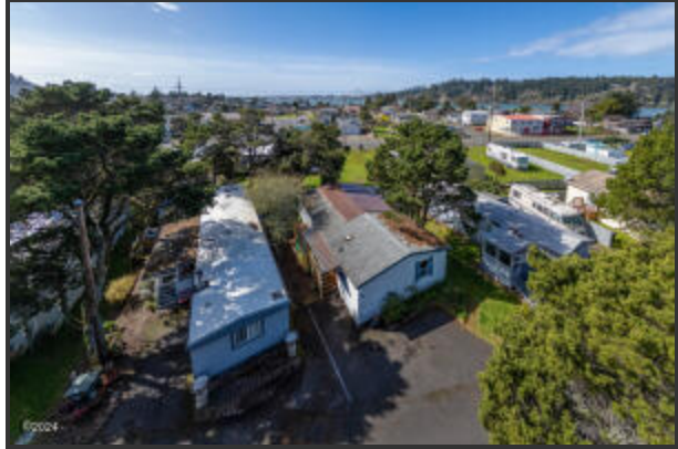
955 NE MILL ST. C-9 (4)