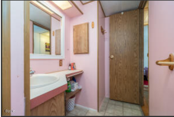
955 NE MILL ST. C-9 (18)