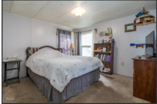
955 NE MILL ST. C-9 (19)