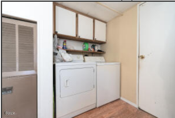
955 NE MILL ST. C-9 (22)