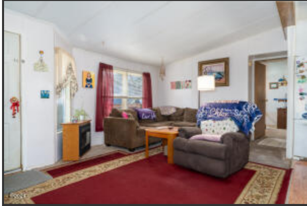
955 NE MILL ST. C-9 (24)