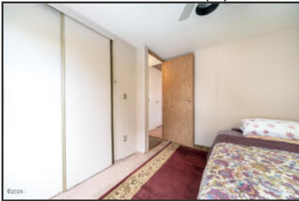
955 NE MILL ST. C-9 (16)