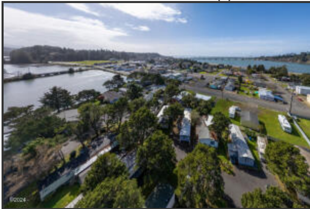
955 NE MILL ST. C-9 (7)