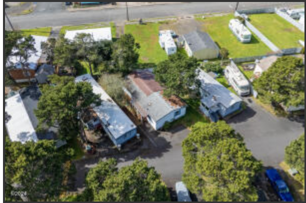
955 NE MILL ST. C-9 (13)