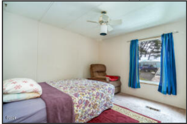
955 NE MILL ST. C-9 (15)