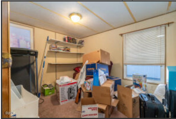
955 NE MILL ST. C-9 (14)