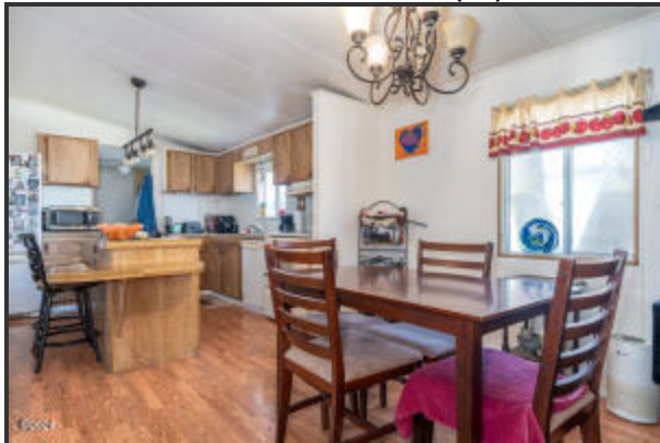
955 NE MILL ST. C-9 (31)