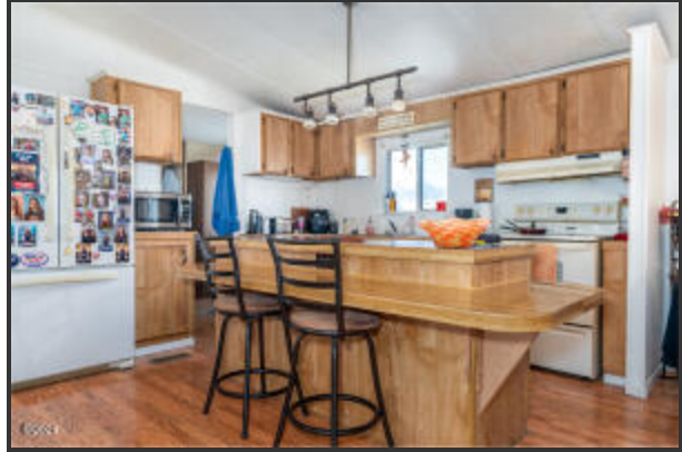
955 NE MILL ST. C-9 (28)