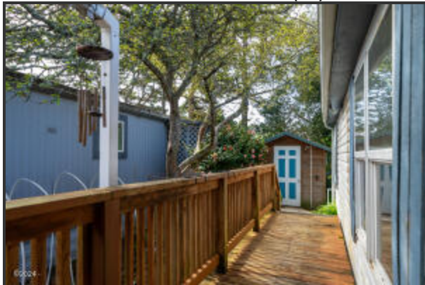
955 NE MILL ST. C-9 (25)