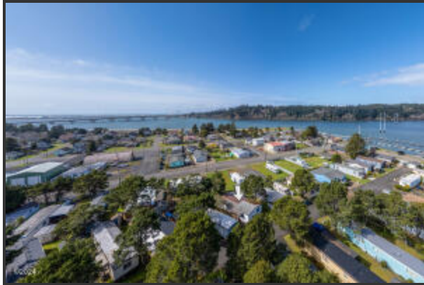
955 NE MILL ST. C-9 (12)