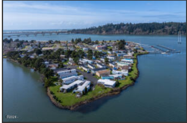
955 NE MILL ST. C-9 (11)