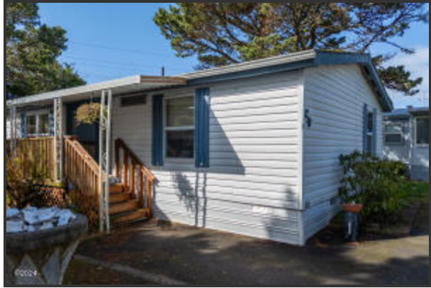
955 NE MILL ST. C-9 (6)