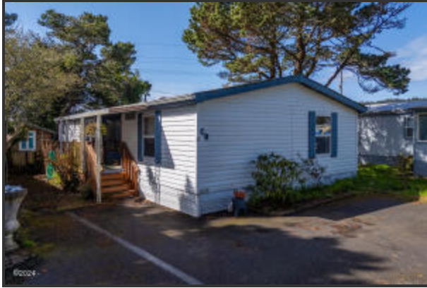
955 NE MILL ST. C-9 (3)