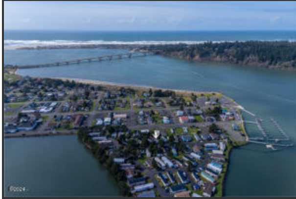
955 NE MILL ST. C-9 (10)