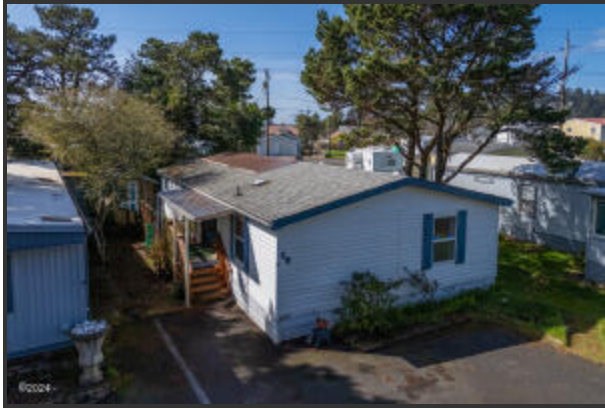
955 NE MILL ST. C-9 (5)