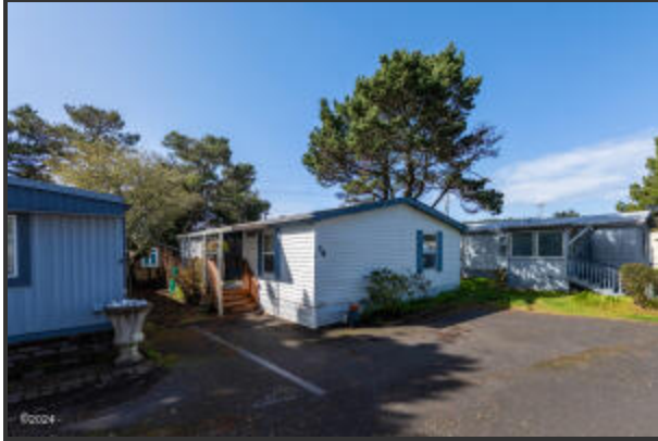
955 NE MILL ST. C-9 (2)