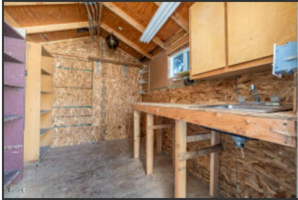
955 NE MILL ST. C-9 (32)