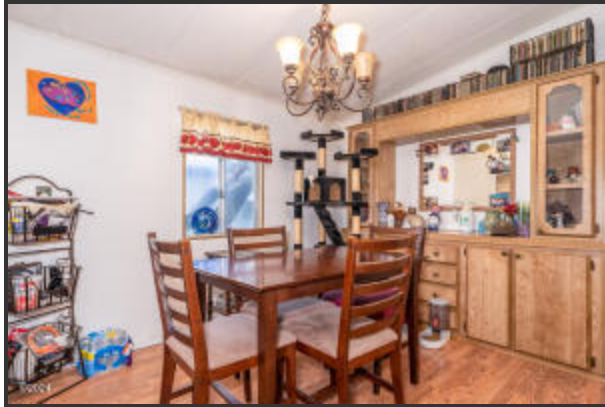
955 NE MILL ST. C-9 (30)