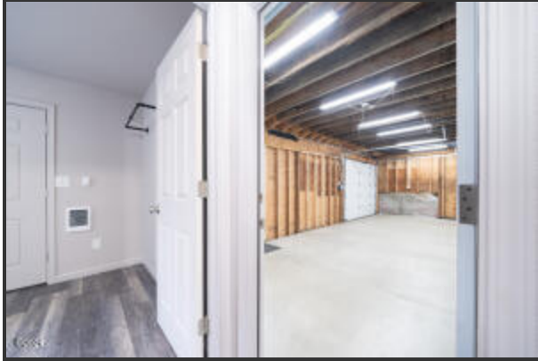
6262 SE ASH LANE (23)