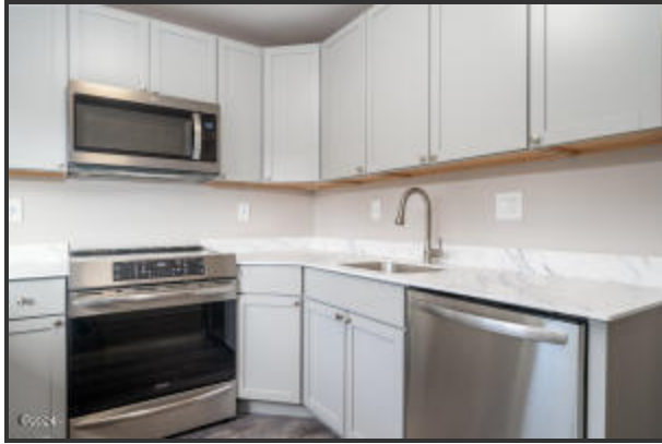
6262 SE ASH LANE (19)