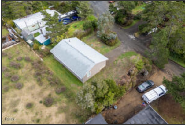
6262 SE ASH LANE (9)