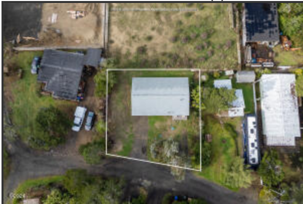
6262 SE ASH LANE (4)