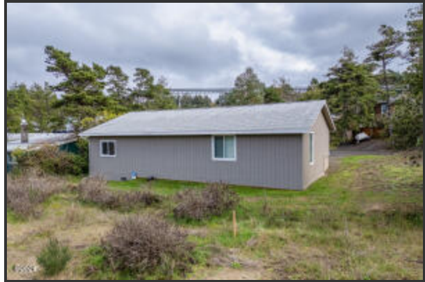
6262 SE ASH LANE (10)