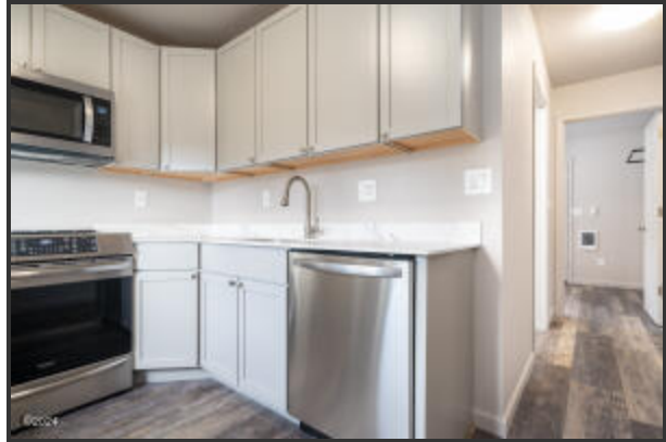
6262 SE ASH LANE (20)