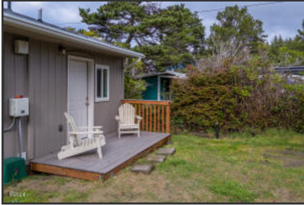
6262 SE ASH LANE (12)