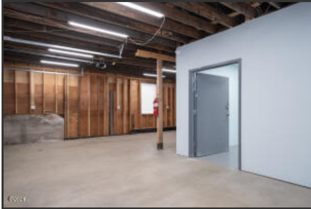
6262 SE ASH LANE (25)