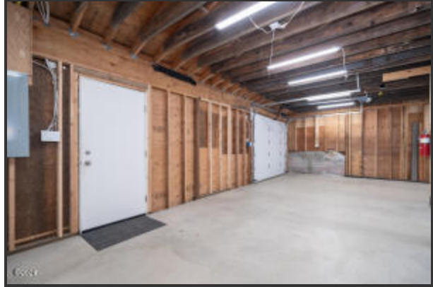
6262 SE ASH LANE (24)