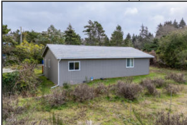
6262 SE ASH LANE (11)