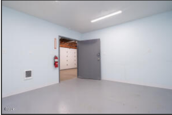
6262 SE ASH LANE (29)