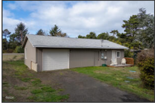
6262 SE ASH LANE (1)