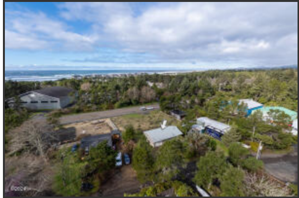
6262 SE ASH LANE (3)