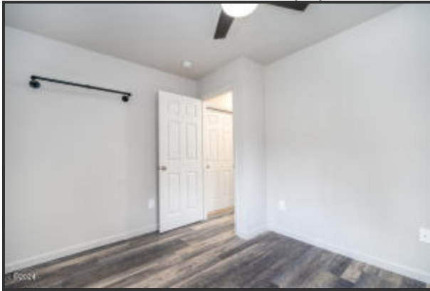
6262 SE ASH LANE (15)