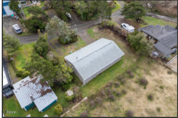
6262 SE ASH LANE (8)