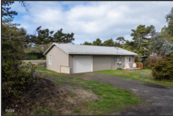
6262 SE ASH LANE (2)