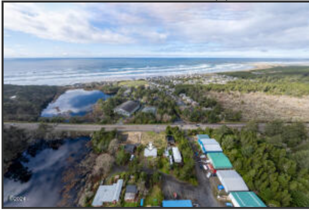
6262 SE ASH LANE (5)