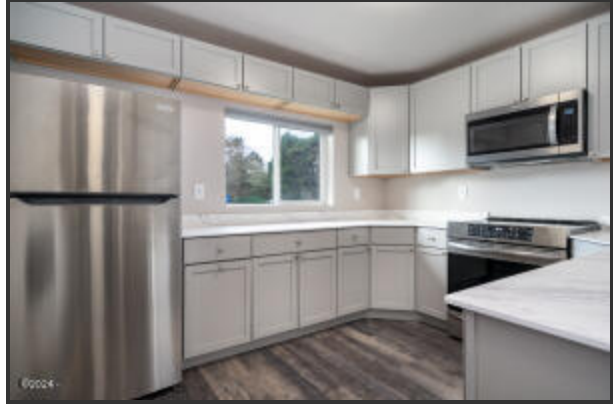
6262 SE ASH LANE (18)