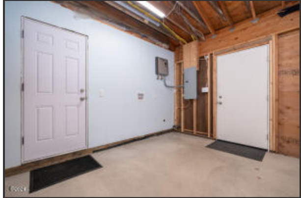
6262 SE ASH LANE (30)