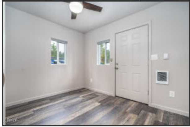
6262 SE ASH LANE (14)