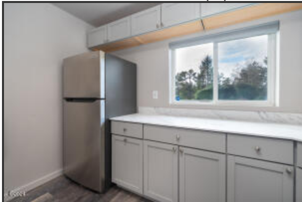
6262 SE ASH LANE (21)