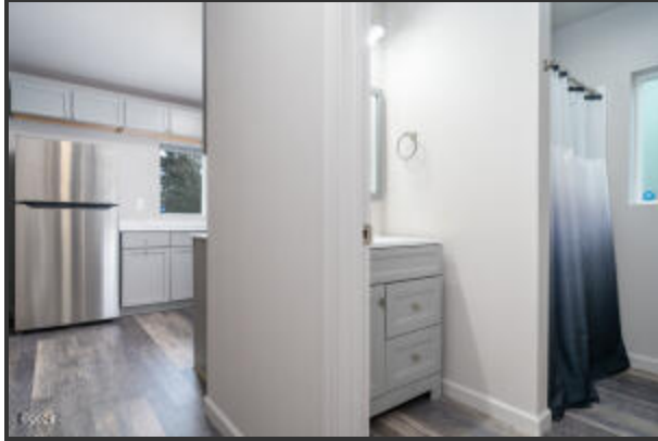
6262 SE ASH LANE (17)