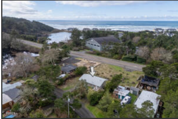
6262 SE ASH LANE (7)