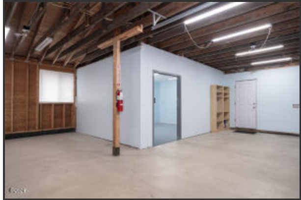
6262 SE ASH LANE (26)