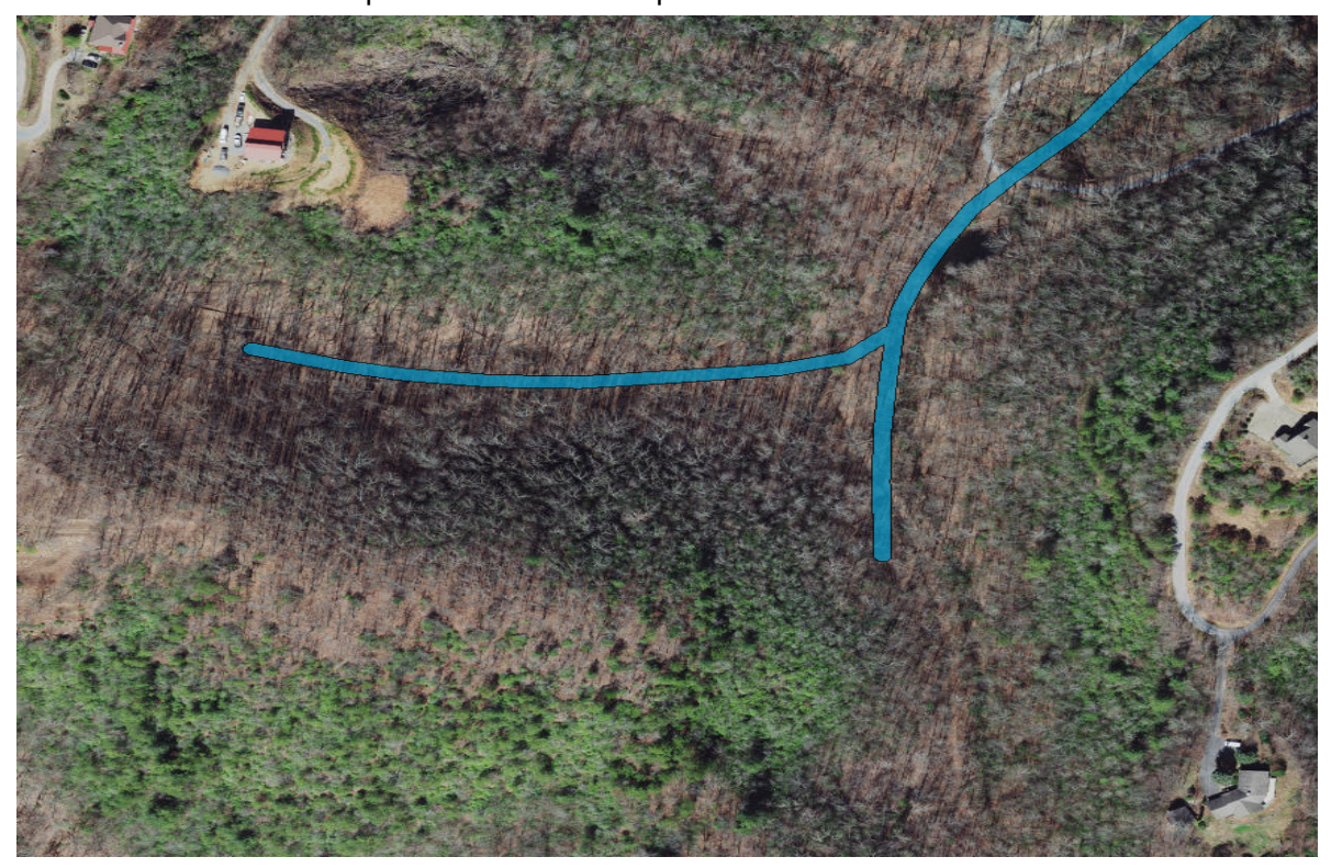
Terrain and Soil: Sylco-Cataska complex, 50 to 95 percent slopes, very rocky. London-Northcove complex, 15 to 30 percent slopes, bouldery. Good for limited farming.

Wetlands: The Riverine System includes all wetlands and deepwater habitats contained within a channel. Surface water is present for extended periods. Classification code: R4SBC