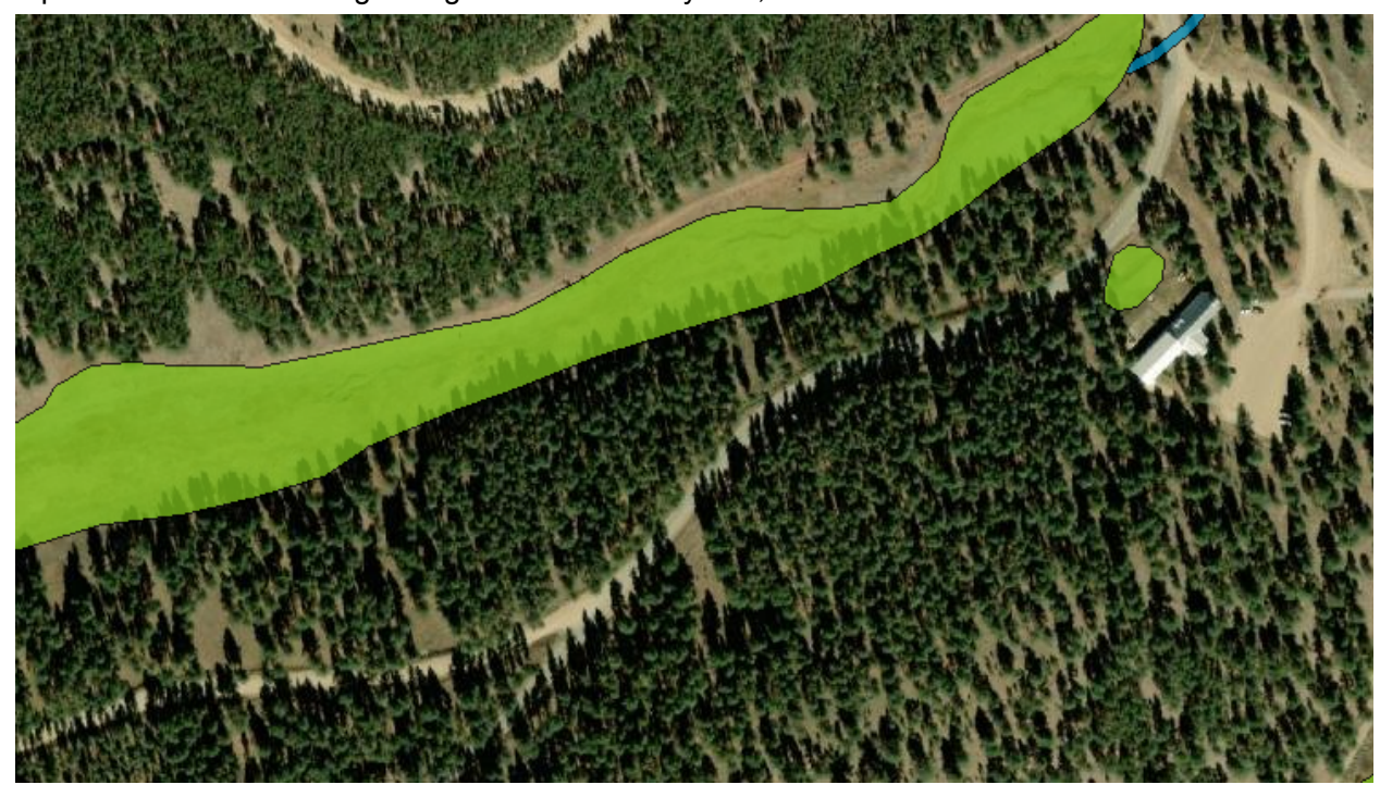
Terrain and Soil: Moreno-Cypher association, hilly. Good for intense grazing and limited farming.

Wetlands: The Palustrine System includes all nontidal wetlands dominated by trees. This vegetation is present for most of the growing season in most years, classified as a PEM1B.